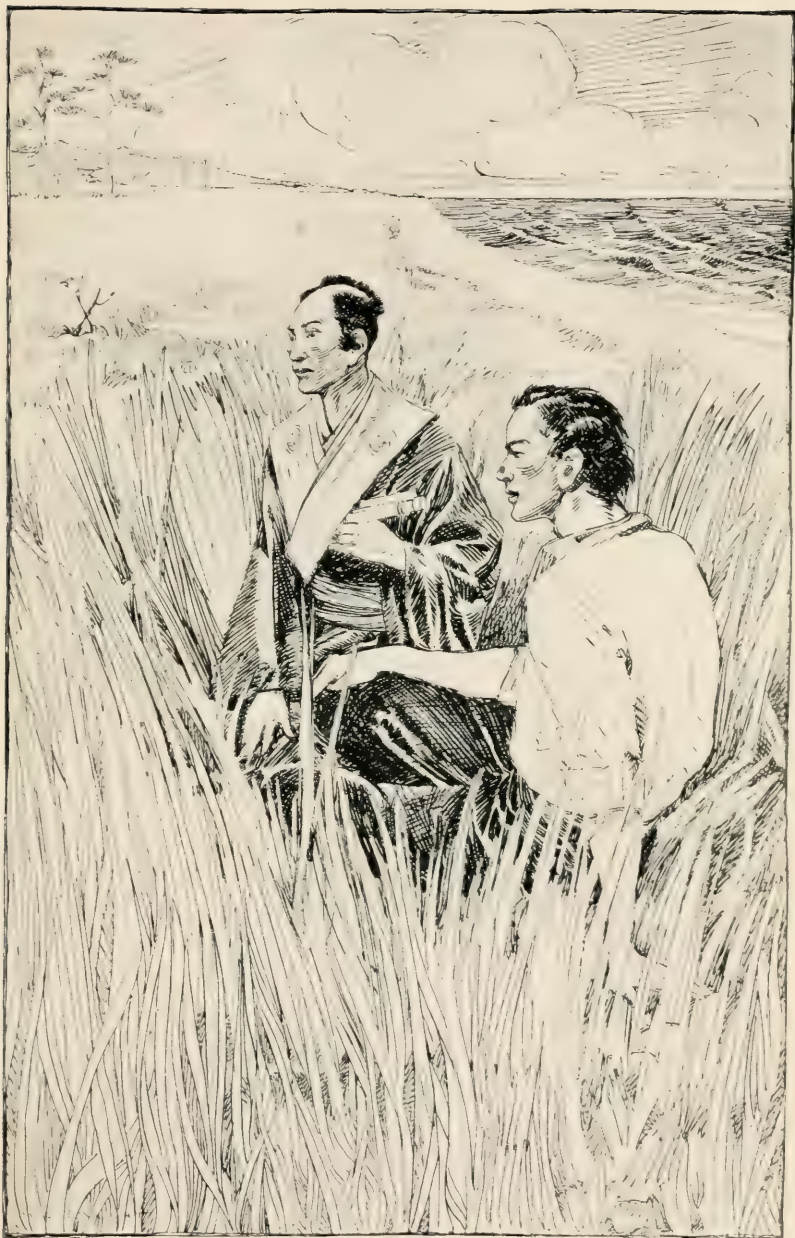
“Tankaro cautiously rose and peered over the friendly grass.”